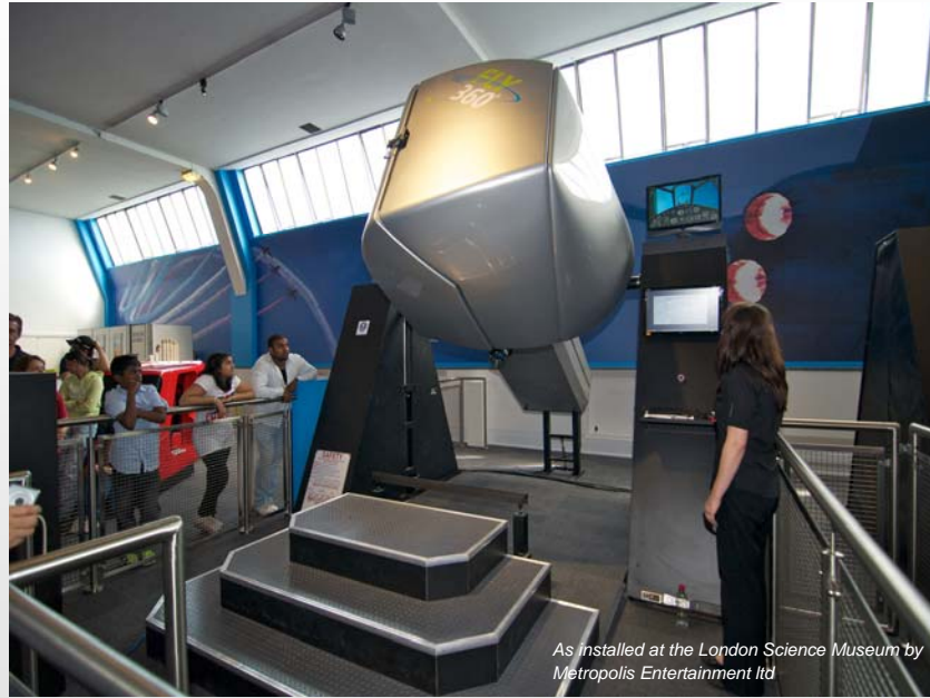
As installed at the London Science Museum by Metropolis Entertainment Ltd